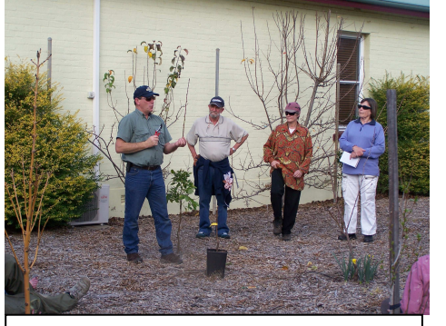
Peter Coppin Workshop

Centre Based Day care at the Eric Farrow Pavilion twice a month continues to remain da popular activity with 12 to 15 attending regularly.