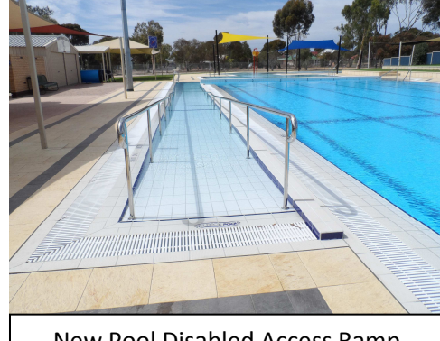
New Pool Disabled Access Ramp

Outcome 3: Information about functions, facilities and services is provided in formats which will meet the communications requirements of people with disabilities.