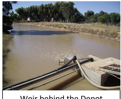
Weir behind the Depot

Installation of a new pipe has begun from Puntapin Dam to the Recreation Ground to irrigate the Woolorama grassed areas, RV area, Shire Office, School Oval, Wetlands Park and Caravan Park. All materials have been purchased and project should be finished and operational in early 2013.